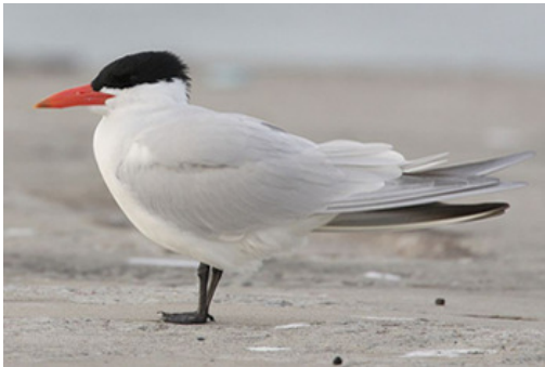
Caspian Tern ( Hydroprogne caspia )