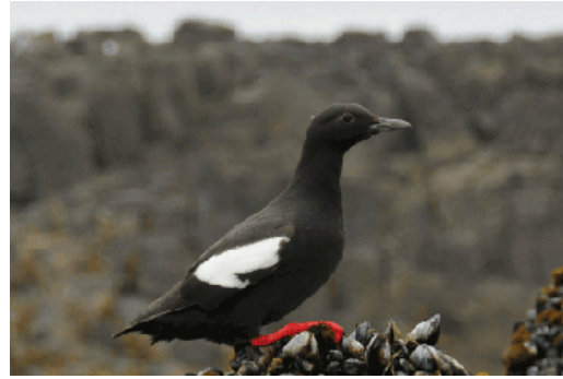
Pigeon Guillemot ( Cepphus columba )