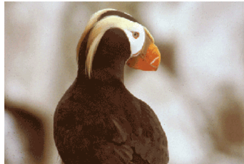
Tufted puffin ( Fratercula cirrhata )