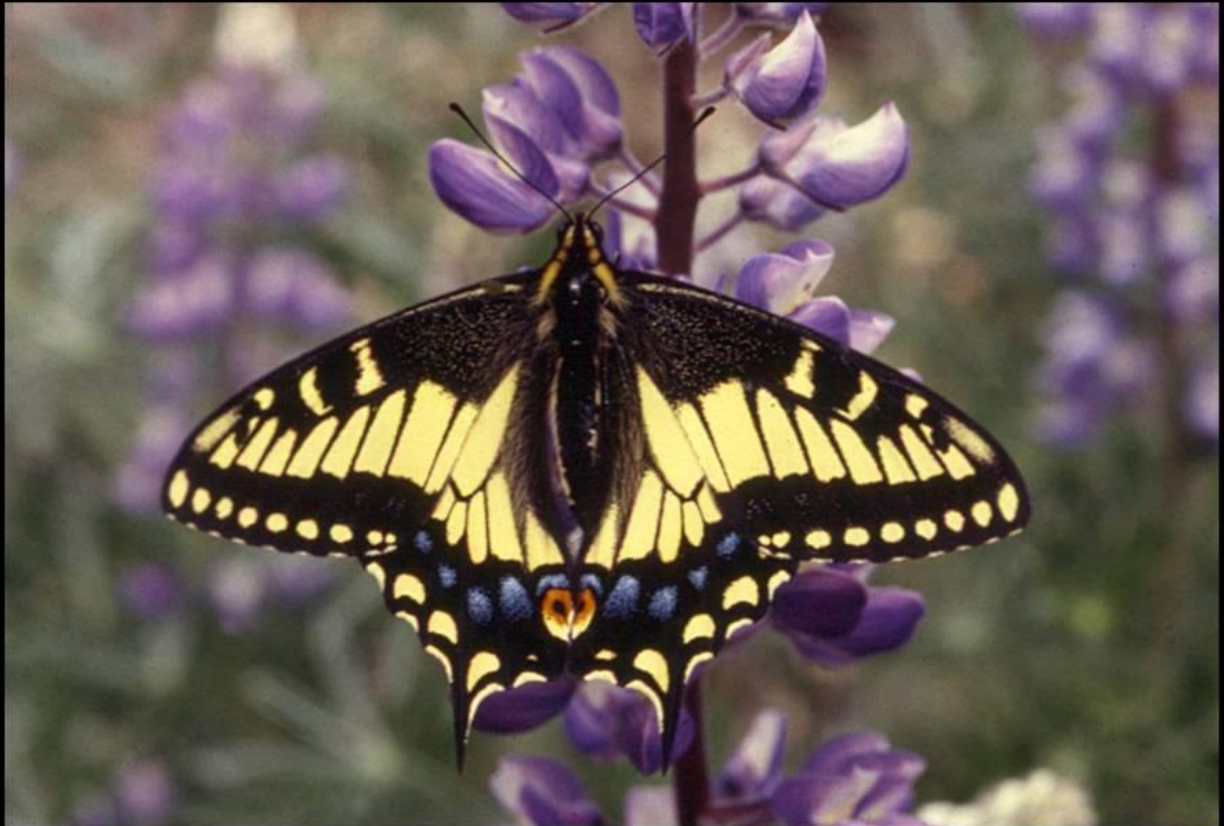
Anise Swallowtail.

Volume Forty-seven, Number Five, May 2012