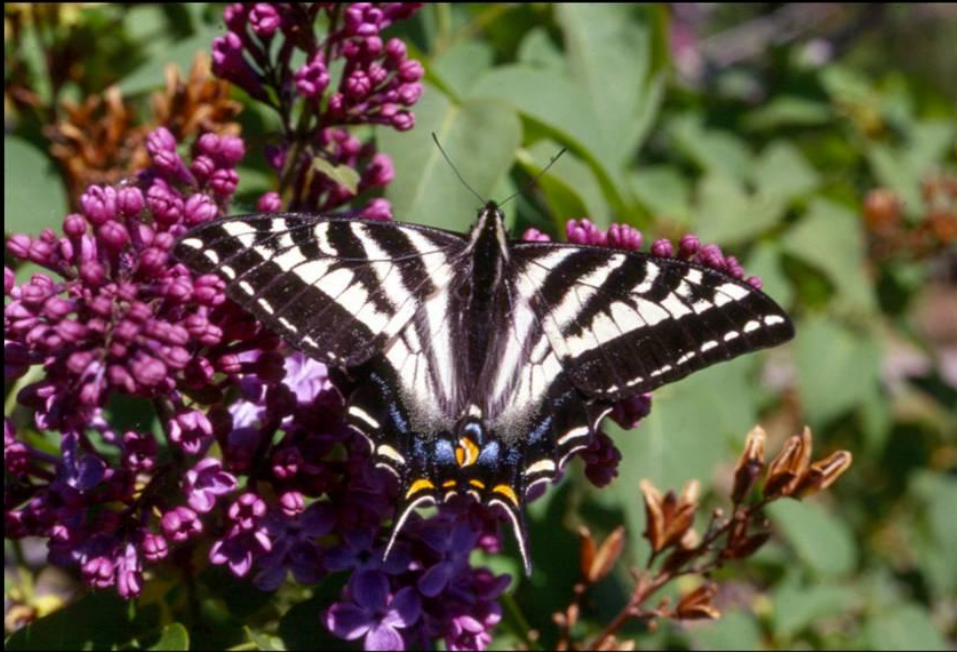
Pale Tiger Swallowtail