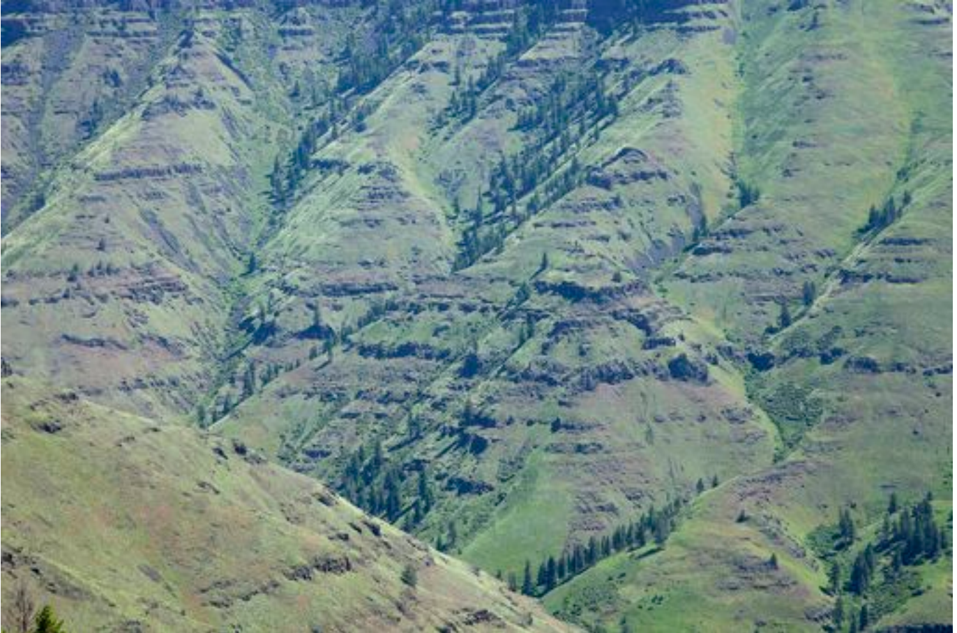
Grande Ronde basalt flows in the Joseph Creek Canyon, Oregon. The Grande Ronde Basalt is part of the Miocene Columbia River Basalt Group.