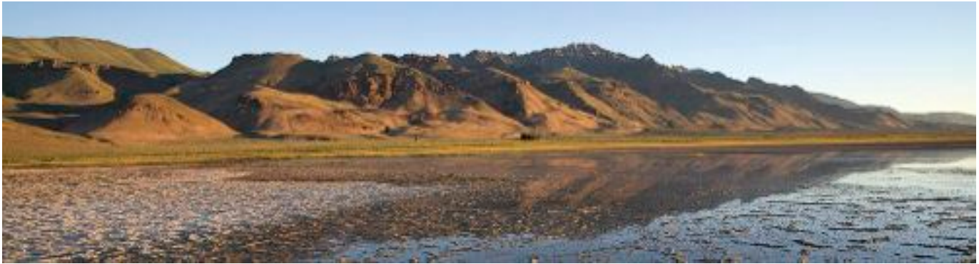
Steens Mountain from the Alvord Desert.